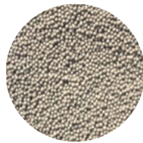
Proppant L 20/40