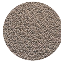
Proppant L 30/50