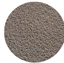
Proppant L 40/70